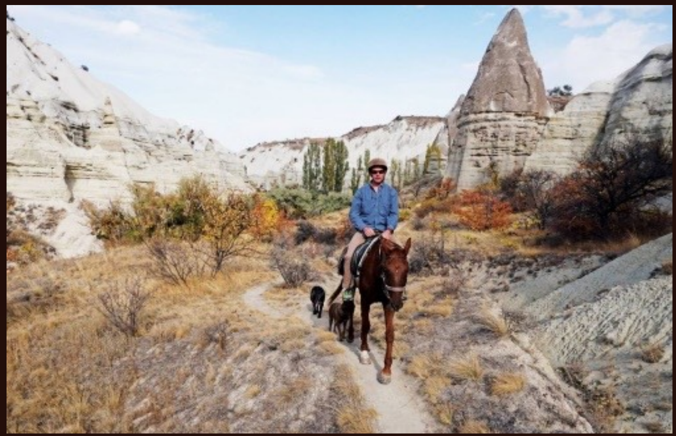
Horse Ride Tour